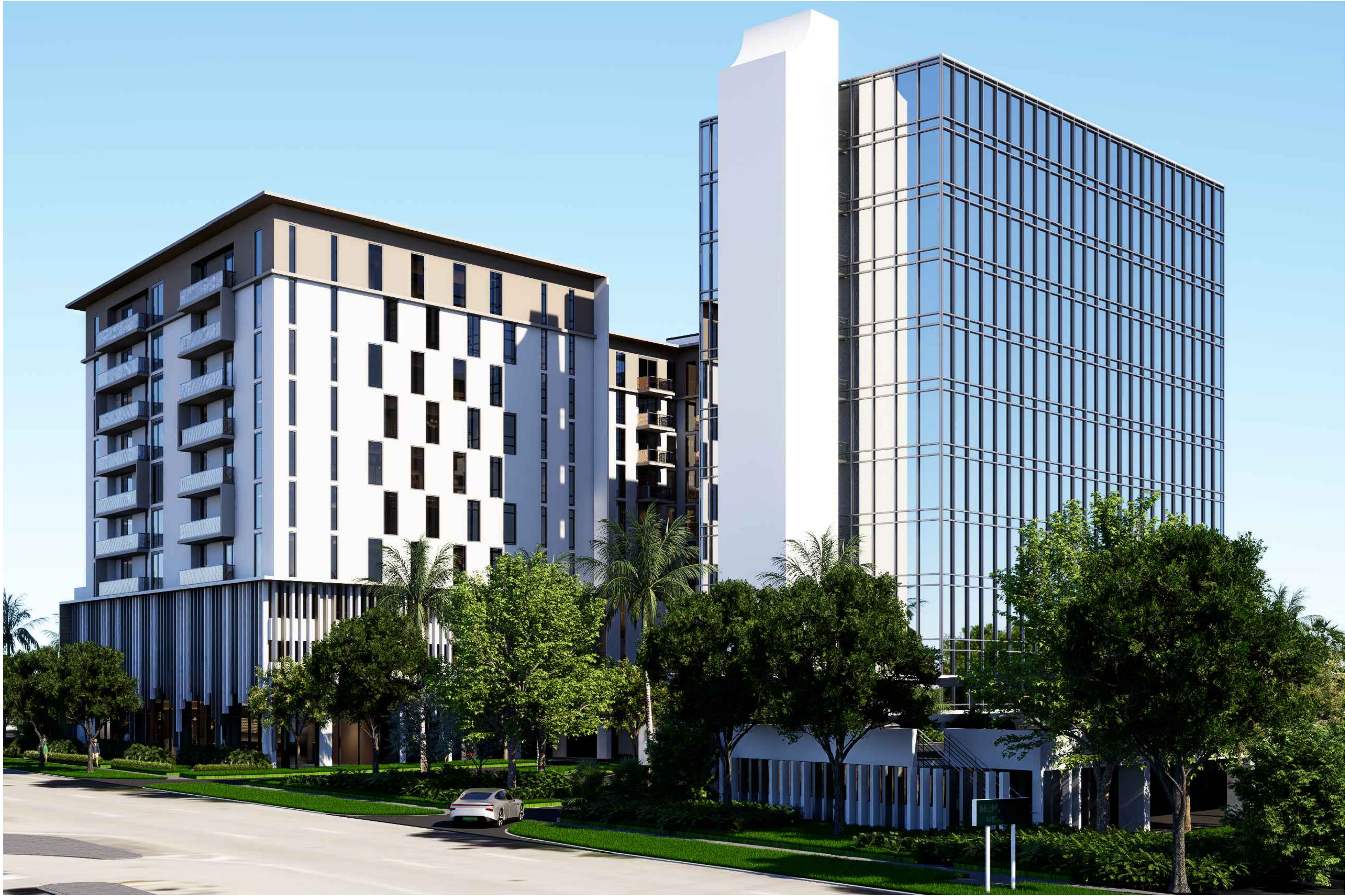
FIRE TRUCK ENTRANCE ON FEDERAL HIGHWAY